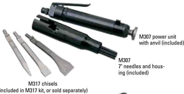
M307 power unit with anvil (included)